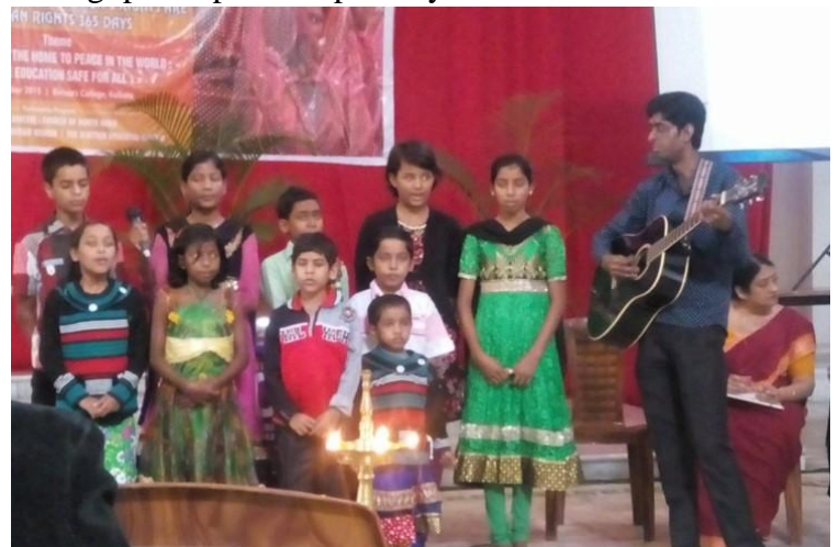
Children of Arunima Hospice through their song sharing their story of discrimination and inviting all to provide them life in its fullness

(9) Sharing by Leaders of Episcopal Church of Scotland during the seminar further provided scope for participants to have an understanding about global scenario and prophetic role of churches in Scotland in their efforts to end gender based violence and make education safe for all and their accompaniment to partner churches.