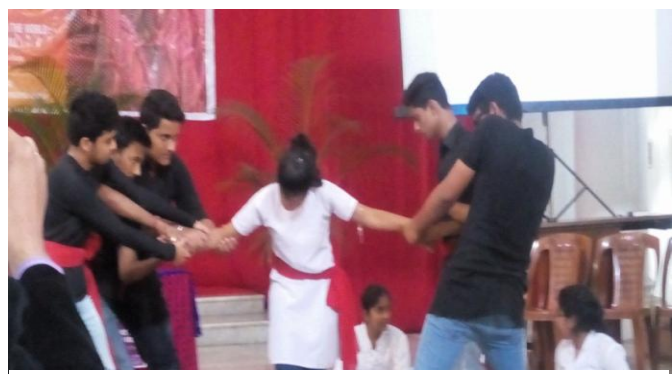
Creative Expressions and Street Theatre Methodology to Create Awareness by Students of St Paul's Mission School

(4)Discussions on ending culture of violence on sexual minorities and promoting their human rights opened up new arena of discussion and awareness about church being true ecclesia of including all in body of Christ and societal role in ending such violence.