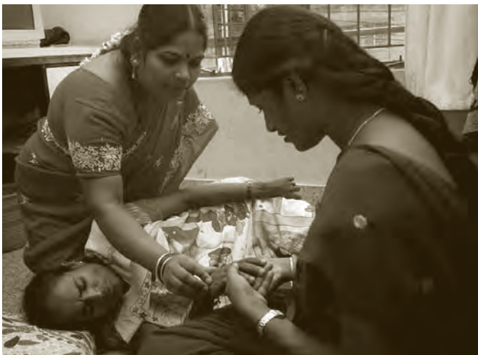
Date original created: 27 March 08 Country:India

Because women tend to use health services in greater numbers than men, particularly during prenatal and perinatal care, they are more likely to know their HIV status than their male partners. The potential risk for HIV transmission during pregnancy, childbirth and breastfeeding feeds a pattern of societal blame in which women are viewed as solely responsible for infecting their children. In many instances, women's disclosure of their positive status encourages the perception that they are vectors of the disease. Women are often blamed for bringing the virus into the family or community. Disclosing their positive HIV status with partners or third parties may increase the risk of violence, stigma and discrimi-