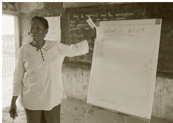
Country: Nigeria

Together We Must! is organized around four broad-based strategies for tackling the intersection: community mobilization to transform harmful gender norms; engagement of marginalized groups that are often more vulnerable to the twin pandemics; development of integrated approaches to support and care; and advocacy for greater accountability among funding agencies and policy makers. Together, these strategies offer valuable lessons and promising practices for