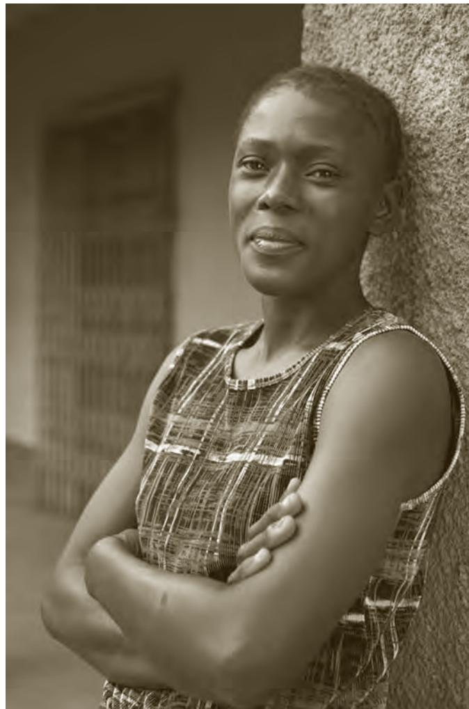
Date original created: 29 September 08 Country: Kenya

The examples detailed here provide two promising models for an integrated approach to addressing the dual pandemics. The first, a 'one-stop shop' for survivors of sexual violence, illustrates a rights-based approach to health care whereby women receive free treatment, care and support in the face of violence and HIV, as well as assistance in doc-