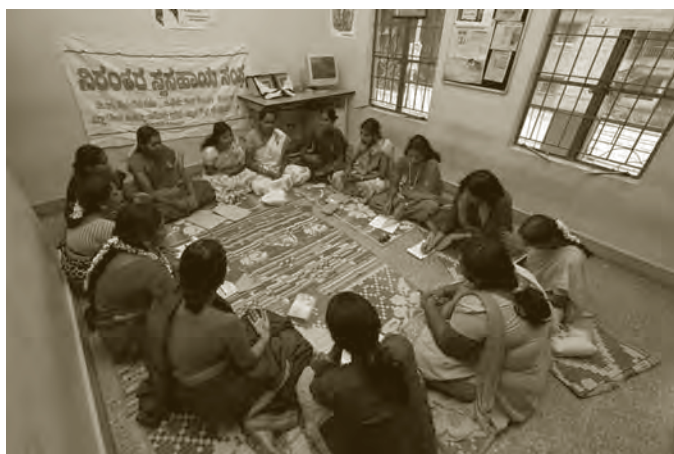
Date original created: 28 March 08 Country: India