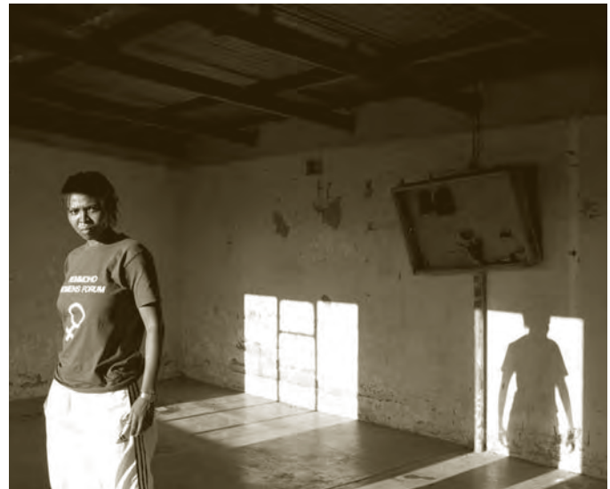
Date original created: 26 January 09 Country: South Africa

The remaining chapters lay out four broad strategies for confronting the intersection of VAWG and HIV&AIDS that emerge from the profiles. Chapter 2 illustrates the importance of involving multiple stakeholders, from men and boys to families and social networks, in strategies to confront the twin pandemics as a means of fostering community mobilization and support. Chapter 3 focuses on the importance of involving marginalized groups in and throughout the programme cycle, from design and implementation to monitoring and evaluation, and examines the ways in which organizations are addressing the impacts of race, class, sexual orientation and age in their work at the intersection of the dual pandemics. Chapter 4 looks at innovative models of health care that integrate sociocultural factors in their care and support, while Chapter 5 examines strategies for using research, advocacy and documentation to hold policy makers accountable. The report closes with five recommendations that emerge from the promising strategies profiled. These recommendations are aimed at governments, civil society groups, individuals and others who might consider similar strategies in their own programming efforts to confront the intersection between VAWG and HIV&AIDS.