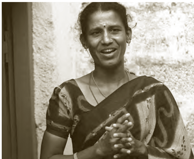
Date original created: 28 March 08 Country: India

However, in the last decade or so, activists in the women's movement have been advocating for the need to address gender issues, including violence against women, in the fight against HIV&AIDS. As more and more women and girls have contracted the disease and its sociocultural and human rights implications have become more widely known, awareness of the linkages between the pandemics has increased. Promising practices facilitate linkages between advocates and activists within the two movements, and strengthen their capacity to work together.